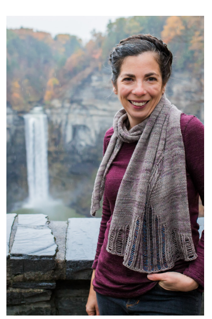
KNIT ITHACA! I 3